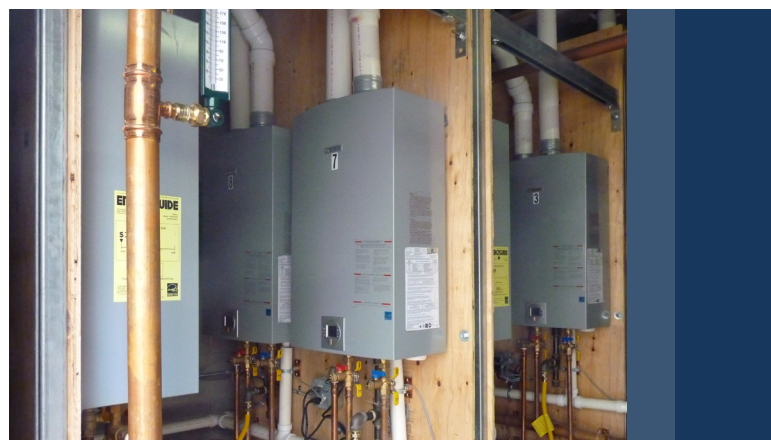
Replacement of old water heating system with ten intelligent cascaded Bosch Greentherm gas condensing tankless water heaters - example of cascade flow diagram shown below.

Heneghan Plumbing was able to keep the existing hot water system running while installing the new system, and Colin added that "the changeover was a lot easier than we ever expected. We found the Bosch units easy to install, program and troubleshoot. It was made simpler with support from Bosch Sales Representative Dan McDermott and Craig Porter from Bosch technical support."