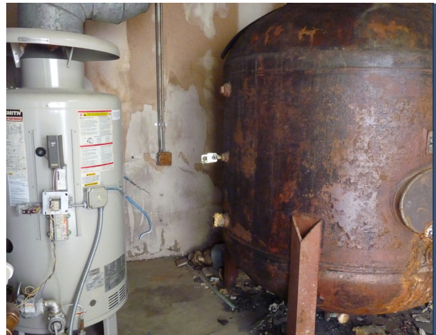
Old gas-fired boiler (left) fed domestic hot water into 500-gallon storage tank (right).

The hotel owner reported fuel savings of approximately $1,500 to $2,000 per month in the first six months of operation. Compared with a competitive tankless installation at a similar hotel with same number of rooms, this Bosch installation saved about $500 more per month.